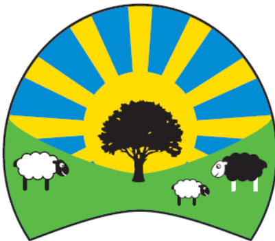
Bentham Community Primary School

Bentham C P School Low Bentham Road Bentham Lancaster LA2 7BP